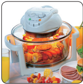
Secura Turbo Oven 777MH & 798DH